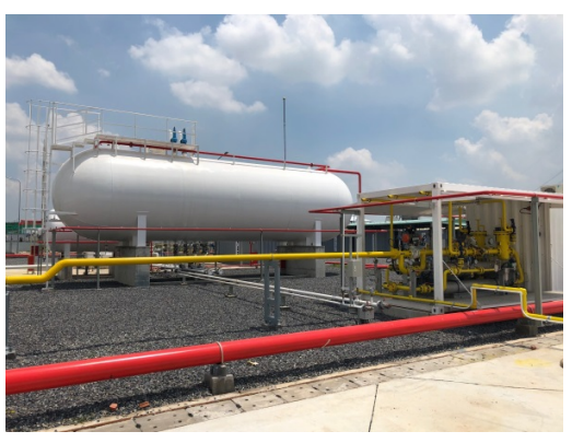
External appearance of the gas supply facility at the Phu My 3 Specialized Industrial Park.